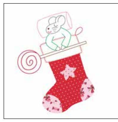
81/2" x 81/2"

Background block: Measurements are unfinished size