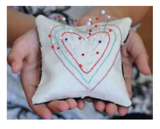
Don't you love your new pincushion?

Pin the opening closed and stitch together by machine or hand.